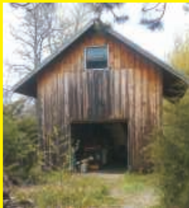
ONE OF THE SECRET HIDEAWAYS