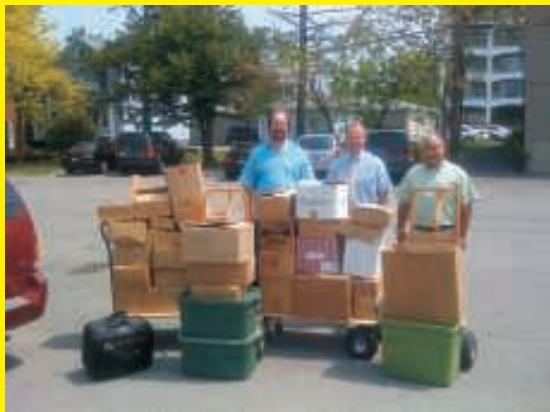
CANADIAN COINS GOING NORTH TO TORONTO