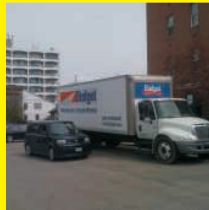
WE FILLED THIS TRUCK WAIST-HIGH TWICE